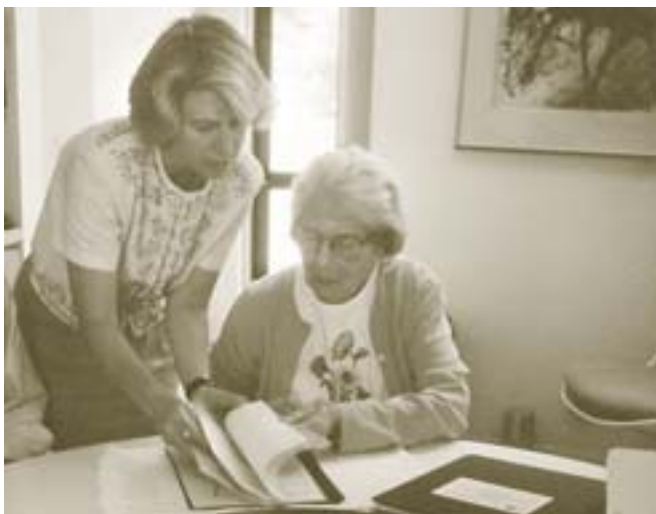
The signing of an easement marks the culmination of the planning and negotiating process.

For more detail on the steps involved in granting an easement, contact Maine Coast Heritage Trust for a copy of Technical Bulletin #108, “The Conservation Easement from Start to Finish: An Overview for Landowners.”