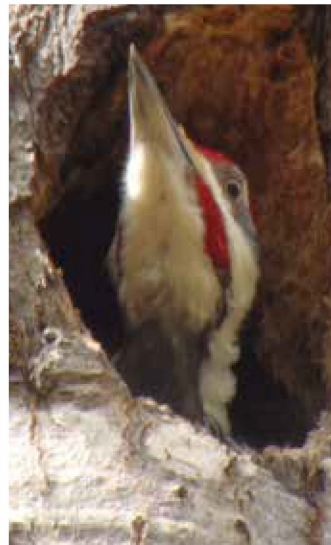
Pileated woodpecker